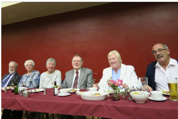
2015/16 Bowling Committee at the Annual Dinner 2016