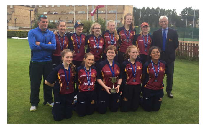
Ladies 3rd XI Minor Cup winning Team

While we look back on the 2017 summer season there are so many great achievements to recognise.