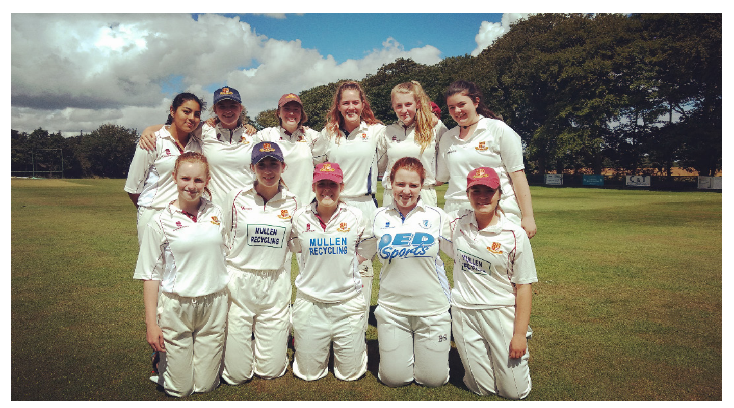
Girls U19 League Winners